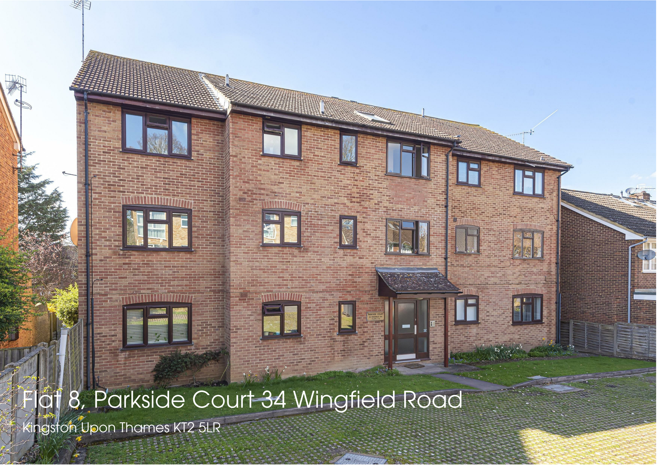
Flat 8, Parkside Court 34 Wingfield Road Kingston Upon Thames KT2 5LR